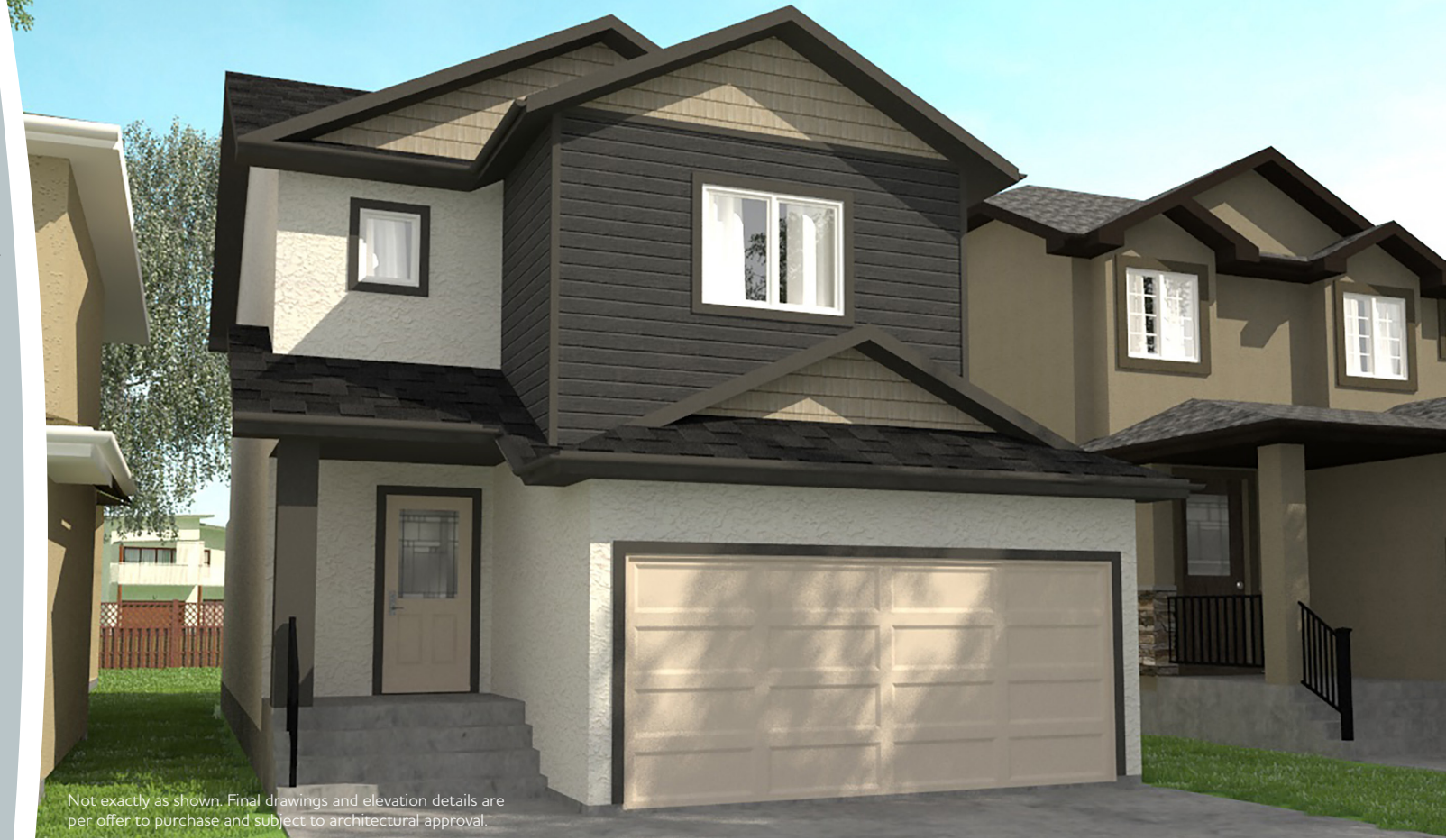
Not exactly as shown. Final drawings and elevation details are per offer to purchase and subject to architectural approval.

Ask your Sales Representative for more information on this home!